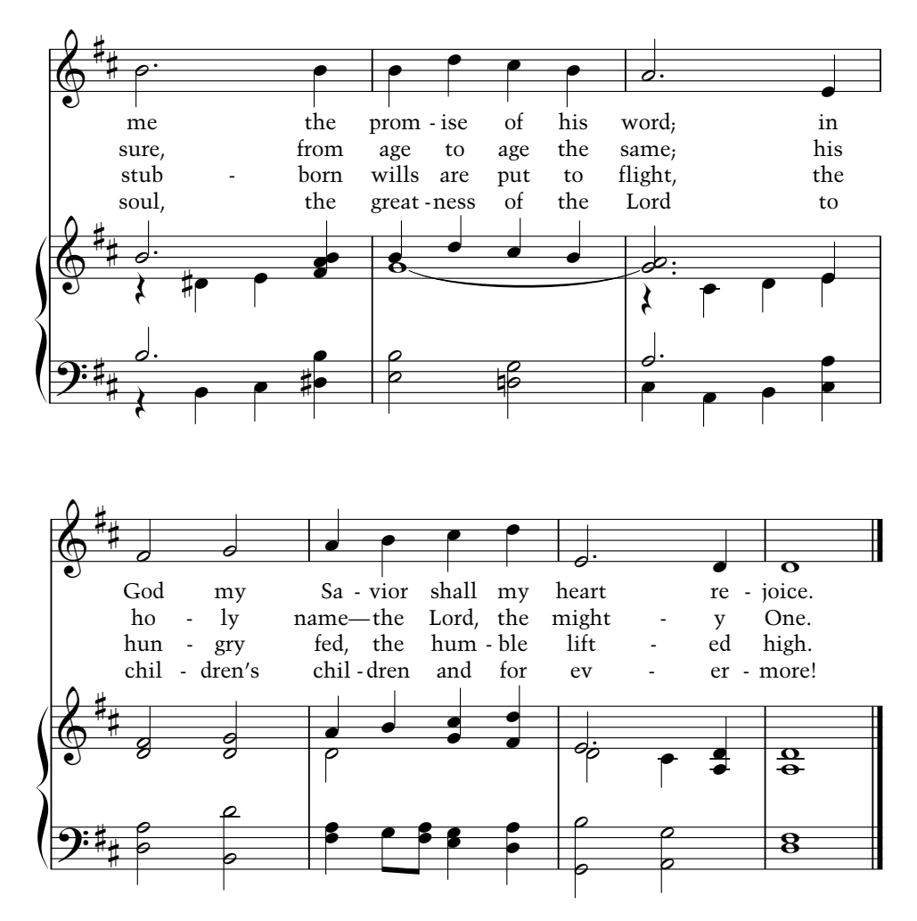
Words © 1962, renewed 1990 Hope Publishing Company, Carol Stream, IL 60188. All rights reserved. Used by permission.